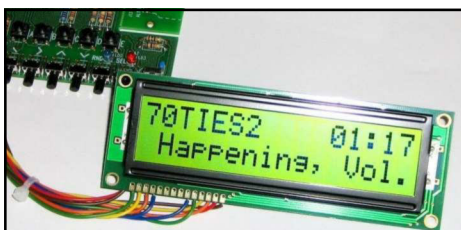
Shown with large LCD