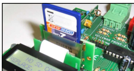
Shown with vertical SD card holder